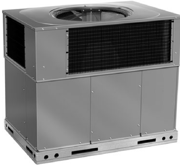
Fig. 1 - Unit - PHR5

15 SEER 2-Stage Packaged Heat Pump System with R-410A Refrigerant Single Phase and Three Phase 2 to 5 Nominal Tons PHR5